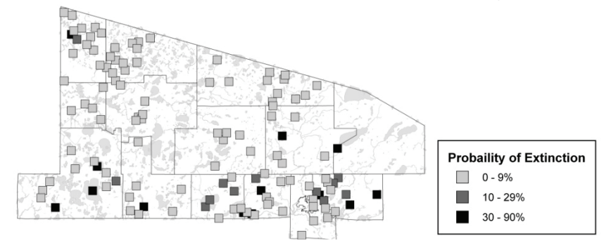
Figure 1.b Output from landscape simulations: 20-year forecast of expected extinction probabilities (mean of 1000 simulations) for green frogs across 138 lakes

Figure 1.a Input to econometric model: spatial-panel data from local land information office and plat maps